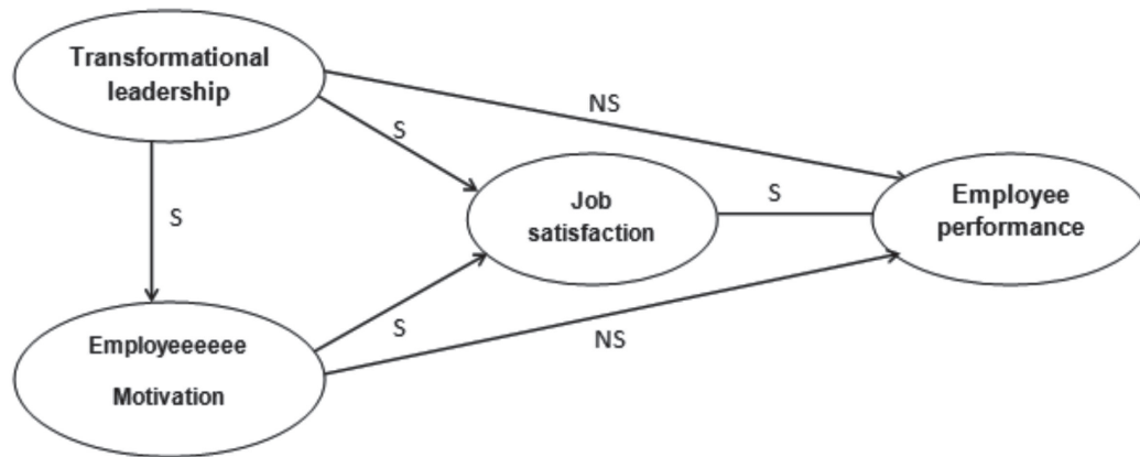
Figure 2. Diagram of Direct Path and Hypothesis Testing

First hypothesis stated the influence of transformational leaderships on employee motivation, values obtained from path coefficient between transformational leaderships on employee motivation is 0.645. This means that transformational leadership has a positive effect on employee motivation. It means that stronger transformational leaderships tend to improve employee motivation. Then values obtained from t statistics between transformational leaderships on employee motivation is 13.622 (t statistics value > 1.96). This means that the transformational leaderships directly give positive and significant effect on employee motivation.