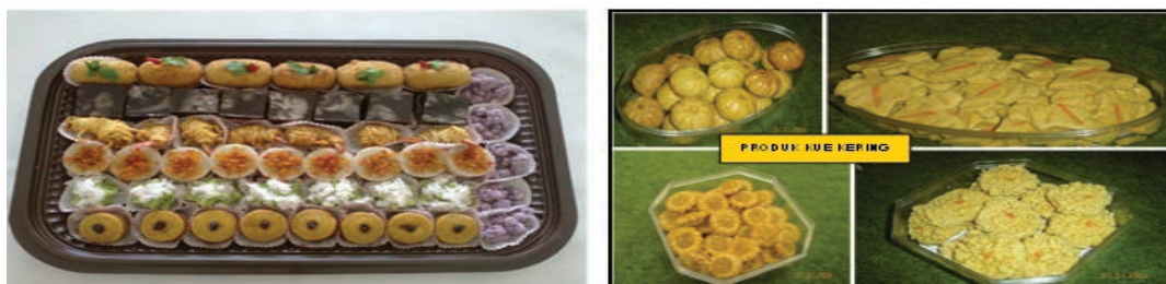
Figure3. Lily Group’s Organic Cakes and Cook