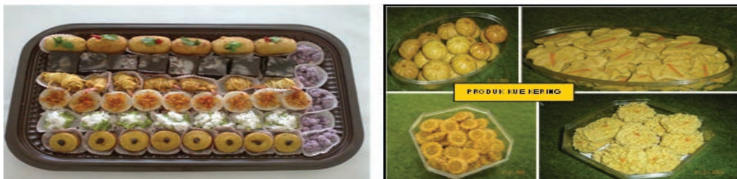
Figure3. Lily Group’s Organic Cakes and Cook